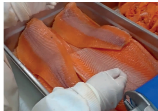
Smoked trout coming out of the V1258 skinning machine (regular skinning)