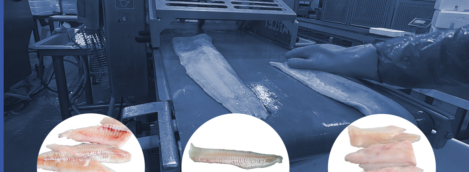
Silver skinning (atlantic wolffish and cod)

The V158S, V158 and V1688 are compact single or double lane skinning machines for small and medium-sized fillets of white fish with soft skin. They are designed to optimize shine and yield, thanks to silver plates that are positioned at the level of the pressure roller (Varlet patent) to hold and guide the fillet. These machines are also suitable for traditional and deep skinning. They feature 2 pressure rollers for simultaneous peeling of 2 fillets, or a single pressure roller for use as a single-lane skinning machine.