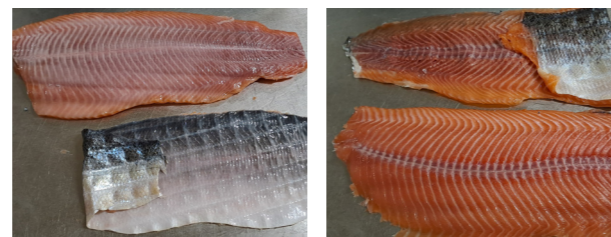
Smoked fish skinned with the V358S machine (left) and deep-skinned smoked fish with the V358L (right)

The feed roller delivers more consistent skinning quality. It also provides greater ease of use: simply push the product flat, without lifting it.