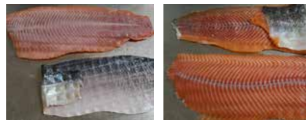
Smoked fish skinned with the V358S machine (left) and deep-skinned smoked fish with the V358L (right)

The feed roller delivers more consistent skinning quality. It also provides greater ease of use: simply push the product flat, without lifting it.